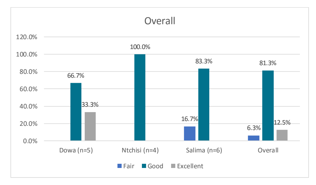
Figure 1: How would you rate your current management skills overall? (Overall, n=15)

The survey suggests overall improvement on management competencies (see figure 1). There is an increase in the participants' rating of their competencies as 'good' from 53.3% in the baseline to 81.3% in the endline across the three districts. Dowa is the only district that has given an 'excellent' rating by 33.3%, which contributes also to an improved overall perception of the management skills among the DHMT. The male participants' competence rating increased, recording an 'excellent' rating by 12.5% in the endline as compared to 0% in the baseline, and the rating as 'fair' and 'good' decreased from 90% in baseline to 87.6% in endline. The highest ranking was registered among male participants in Dowa, followed by Salima, while Ntchisi district remained constant. Female participants showed a great improvement in their perceived management skills, as 100% rated their competencies as 'good' in the endline compared to 14.3% in the baseline. The highest increase among female participants that rate their skills as 'good' is registered in both Dowa and Ntchisi districts (100% 'fair' in baseline vs 100% 'good' in endline). Figure 1 demonstrates managers' perceptions regarding their level of management skills.